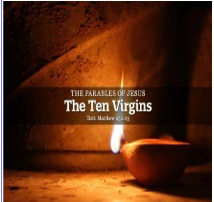
THE PARABLES OF JESUS The Ten Virgins Text: Matthew 25:1-13