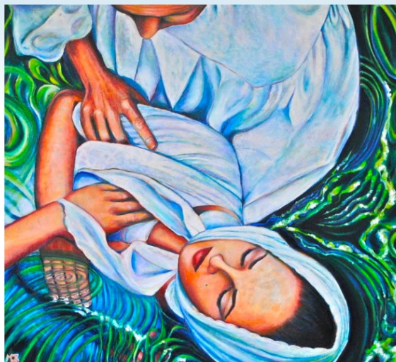
Rappahannock Baptism

Join fellow Catholics and Discerning Deacons as we continue the exciting conversation about this topic raised in the October 2023 synod, including exploration of restoring women as deacons in the Catholic Church.