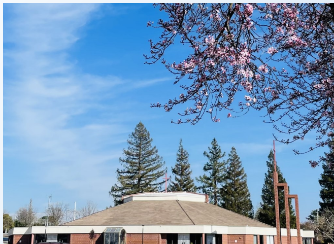
ST. JOHN THE EVANGELIST CATHOLIC CHURCH WITH CHERRY BLOSSOMS