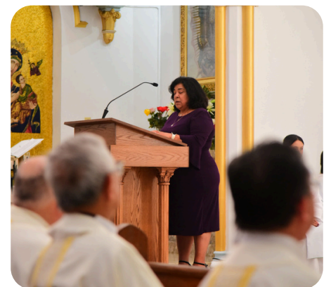
Lectors | Lectores