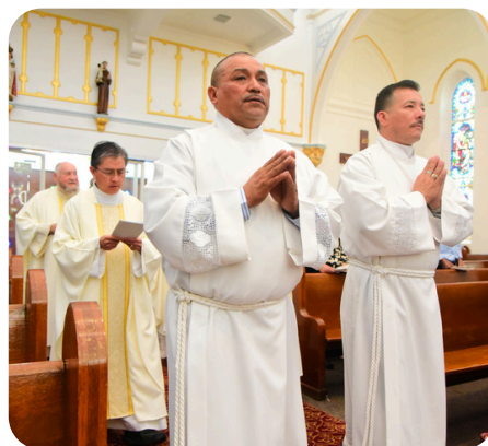
Acolytes | Acolitos