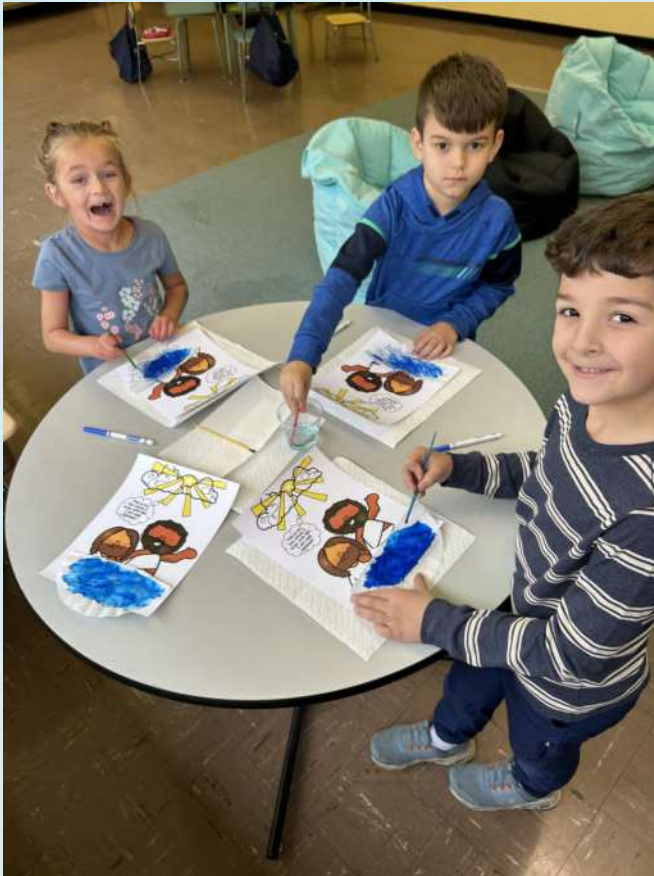
First grade learned about Jesus' Baptism and about John the Baptist