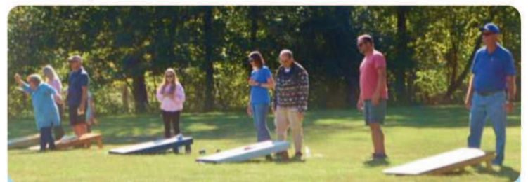
Council 5501 hosts a family picnic and cornhole contest.

Look for Episode #4 in next week's bulletin.