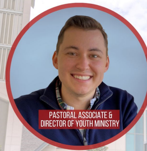
PASTORAL ASSOCIATE & DIRECTOR OF YOUTH MINISTRY

THANK YOU FOR YOUR SERVICE & BLESSINGS ON YOUR NEW ADVENTURE