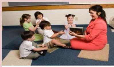
This Photo by Unknown Author is