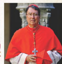
HIS EMINENCE CHRISTOPHE CARDINAL PIERRE Pope Francis' Ambassador to the United States of America