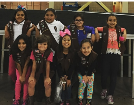
St. Luke Catholic School Brownie Troop 280 (2nd and 3rd gr.) volunteered Wed., Nov 23, at The Annual Raul Jimenez Thanksgiving Dinner.

Please take a picture of your child while reading on your holiday travels. Then send a copy of the photo with name, homeroom, and title of the book that they are reading on the back. Please send the picture (one per student) in to the library by Thursday, January 5. The photos will be placed on a bulletin board outside the library.