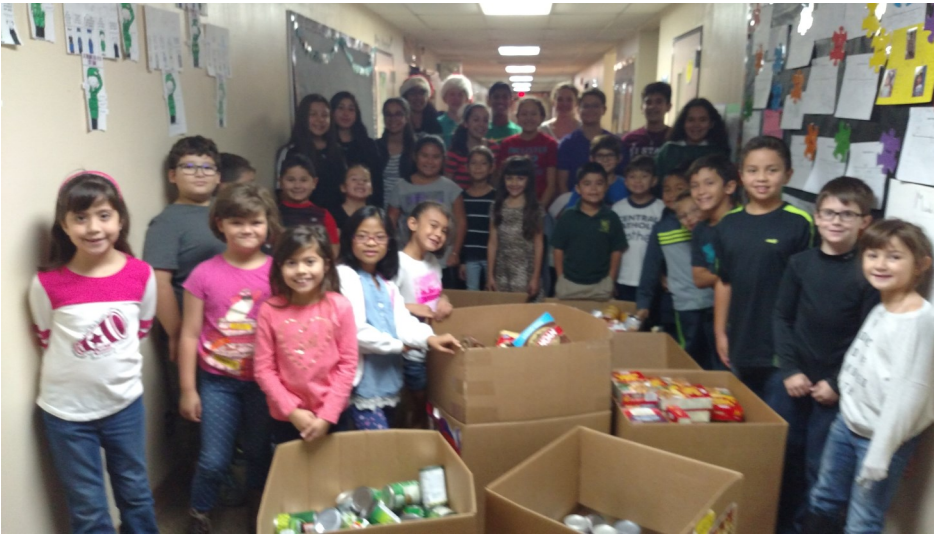
Students from second grade classes and the Beta Club coordinated the school's annual Thanksgiving Food Drive. St. Luke St. Vincent de Paul was most grateful for the donations that they received. Food items were used to make Thanksgiving baskets for families.

Virtue of the Month recognitions for November will take place after Mass tomorrow, December 1.