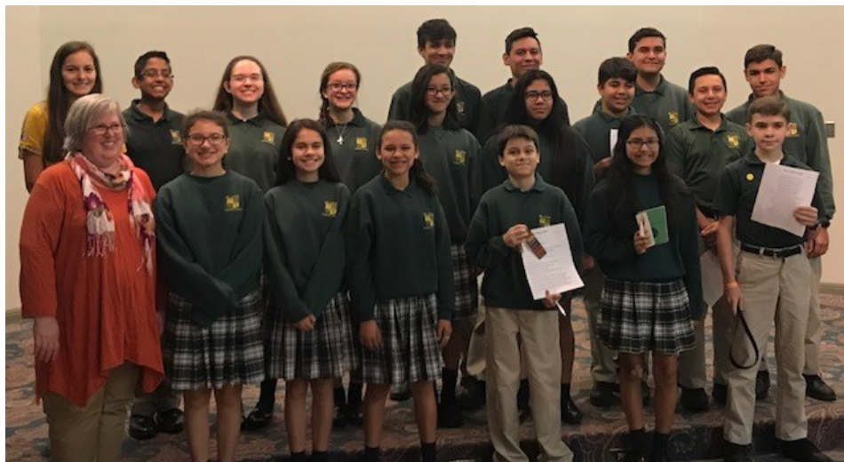
Middle Spoken Word: Students in grades 6—8 shared original poems during our spoken word event on April 30th. Their beautifully written poetry truly captured the essence of humanity. Congratulations poets!

Visit the Denim & Diamonds page for more details and for sponsorship information.