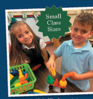
Jr. K & Kindergarten Play Based Learning