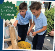
4th Grade Worm Composting