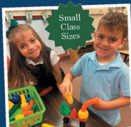
Jr. K & Kindergarten Play Based Learning