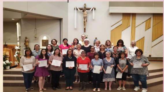
10 th April 2026 (Friday) - Culminating event

Congratulations to the Women of Grace participants who have completed the Study Program from September 2025 to March 2026