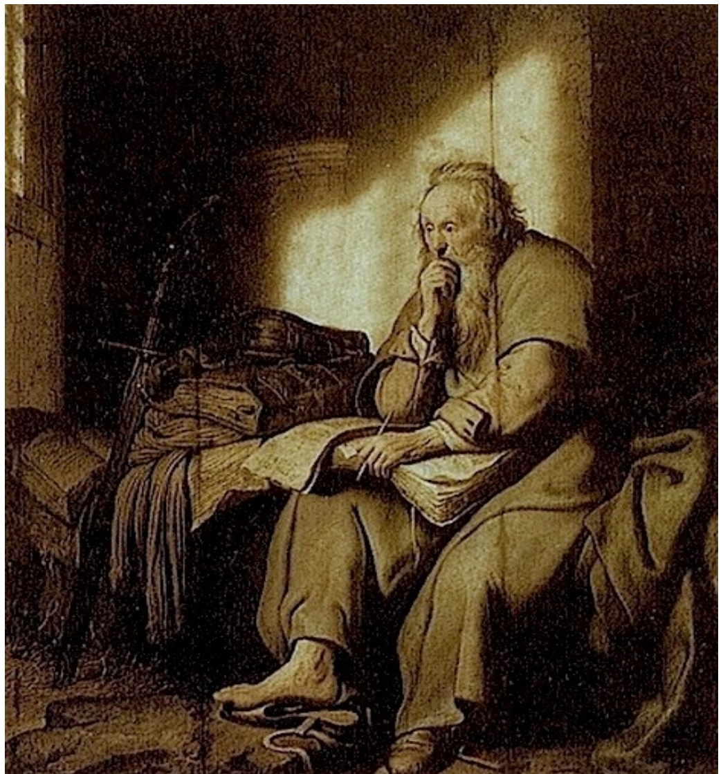
Remember your memories, O Lord. (Responsorial Psalm)