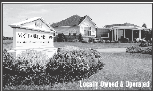
Locally Owned & Operated

Tuesday February 27th at 12 Noon. It will be held in St. Anne's room