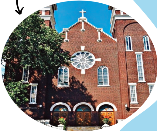
CHRIST THE KING