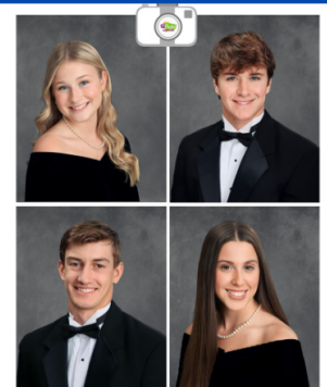
Wednesday, August 16th: INCOMING SENIORS DRAPE AND TUX PHOTOS WILL BE TAKEN