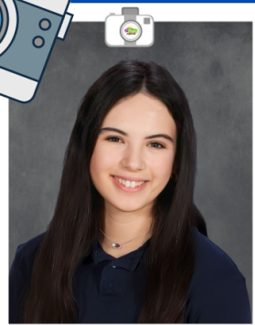
Wednesday, August 16th: RETURNING STUDENTS PLEASE WEAR A UNIFORM TOP

Seniors: You will have composite photos taken at orientation. Please ensure your hair is also dress code compliant. Formal wear will be provided.