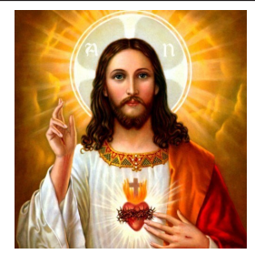
Join Us FIRST FRIDAY TO CELEBRATE THE SODALITY OF THE MOST SACRED HEART Friday, May 5

11:30am - Noon Adoration & Benediction 12:10pm - Mass