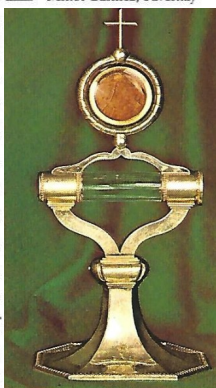
Monstrance containing the relic of the miraculous Host