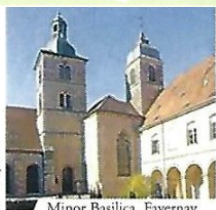
Minor Basilica, Faverney