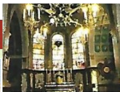
Interior of the church