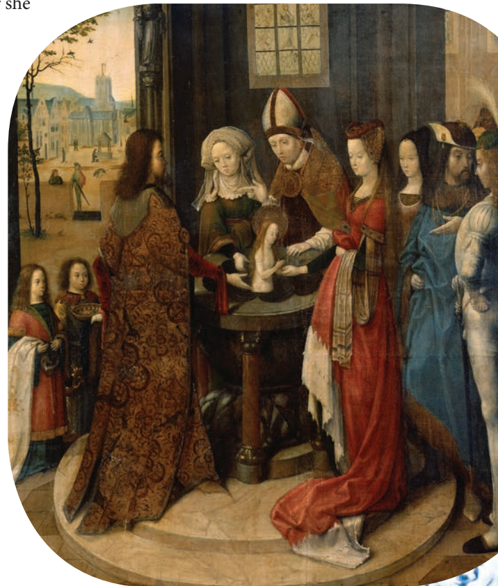
Baptism of St. Ursula / Scala / Art Resource, NY

Consider the effects of your Baptism and your own life of faith, the faith you will profess at your child's Baptism. What is going well in your spiritual life? Where could you use some improvement to be the best model and guide for your child?