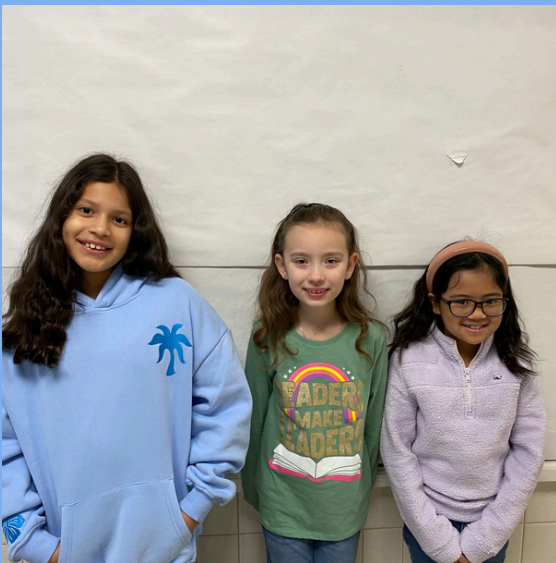
3rd Grade wears their dress-up.