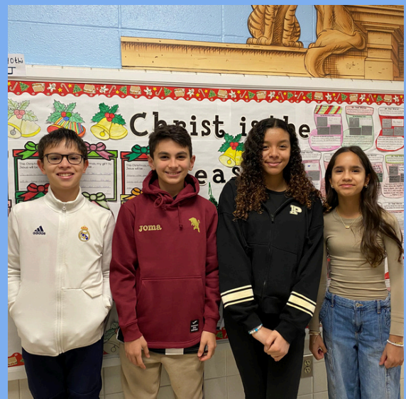
7th grade wears their dress-up.