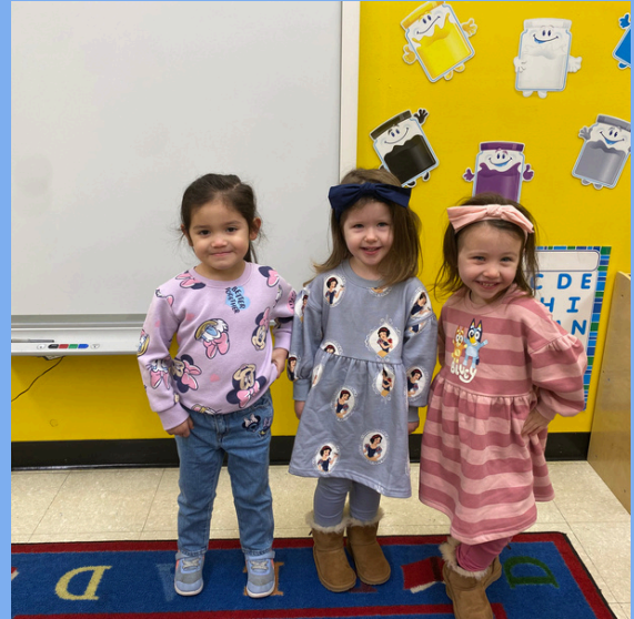
Pre-K 3 wears their dress-up.

Each student went to school looking great in their dress down outfit .