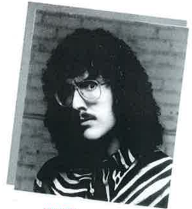
"WEIRD AL" YANKOVIC