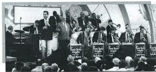
THE TOMMY DORSEY ORCHESTRA Conducted by Buddy Morrow