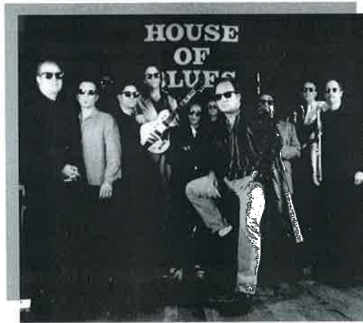
JIM BELUSHI & THE SACRED HEARTS BAND