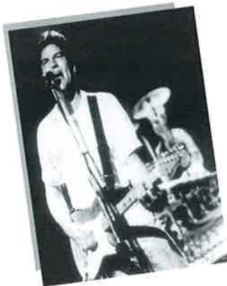
THE MAX CARL BAND