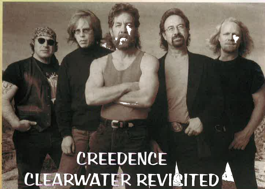
CREEDENCE CLEARWATER REVISITED