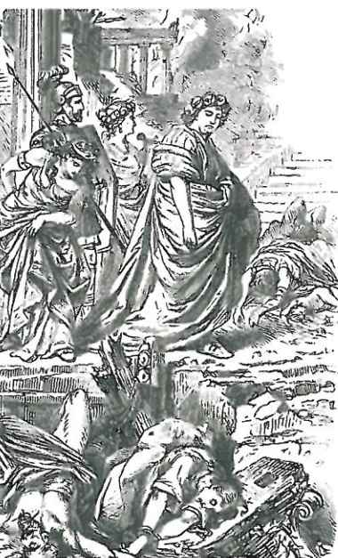
ROLIAN EMPEROR NERO. LEFT FROM “HISTORY OF THE CHURCH.” SECOND 1880.

Instead of worrying about the end of time, an Antichrist, a final battle, and “evil” numbers, Catholics are encouraged to believe that Christ has already conquered sin, death, and Satan. God’s reign is already here in our midst (see Luke 17:20–21). Our task is to prepare for our own moment of dying and meeting the Lord. We leave the rest to God’s providence!