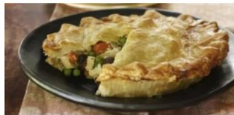
CHICKEN POT PIES*

All our pies are made by hand using fresh ingredients. The pies arrive frozen and uncooked, ready to be baked in your oven.