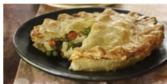
CHICKEN POT PIES*

All our pies are made by hand using fresh ingredients. The pies arrive frozen and uncooked, ready to be baked in your oven.