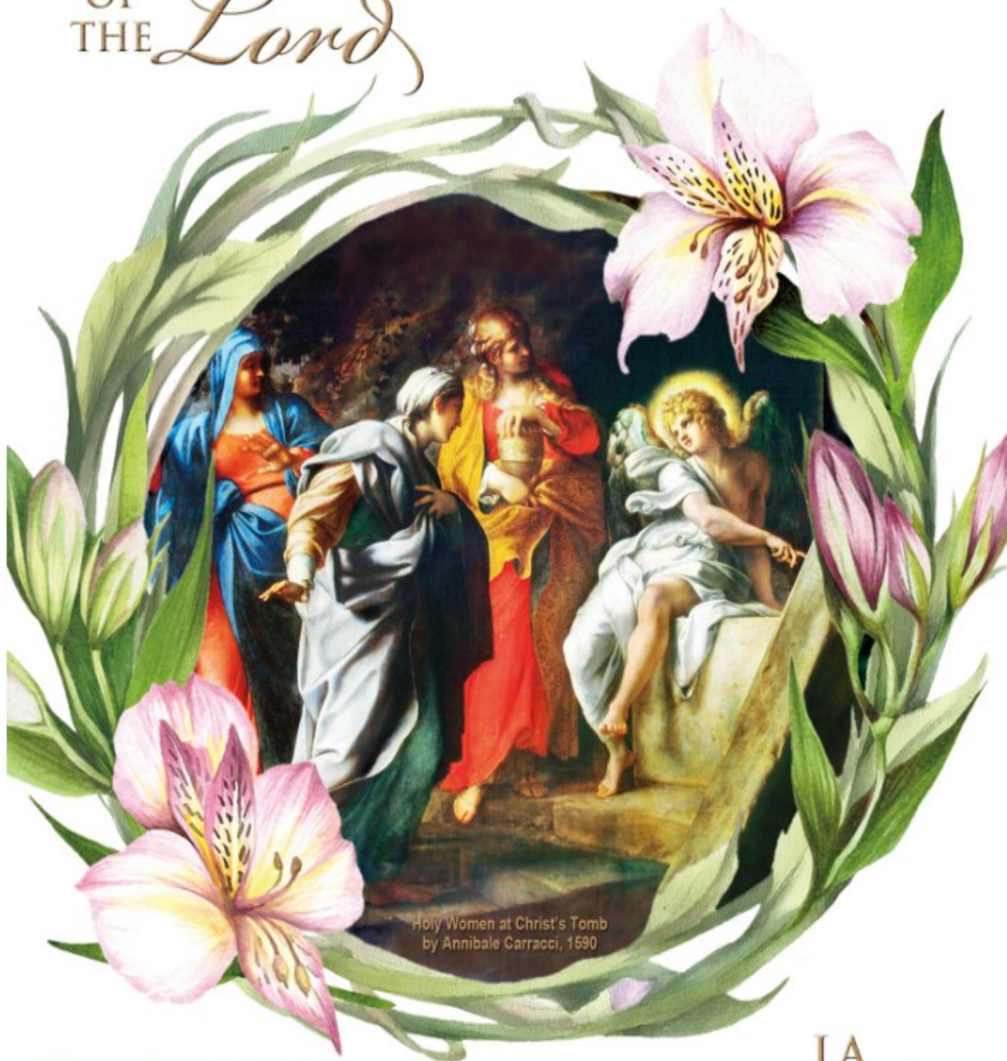
Holy Women at Christ's Tomb by Annibale Carracci, 1590

"¿Por qué buscan entre los muertos al que vive? No está aquí. Resucitó. "