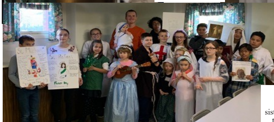
Sunday, October 27