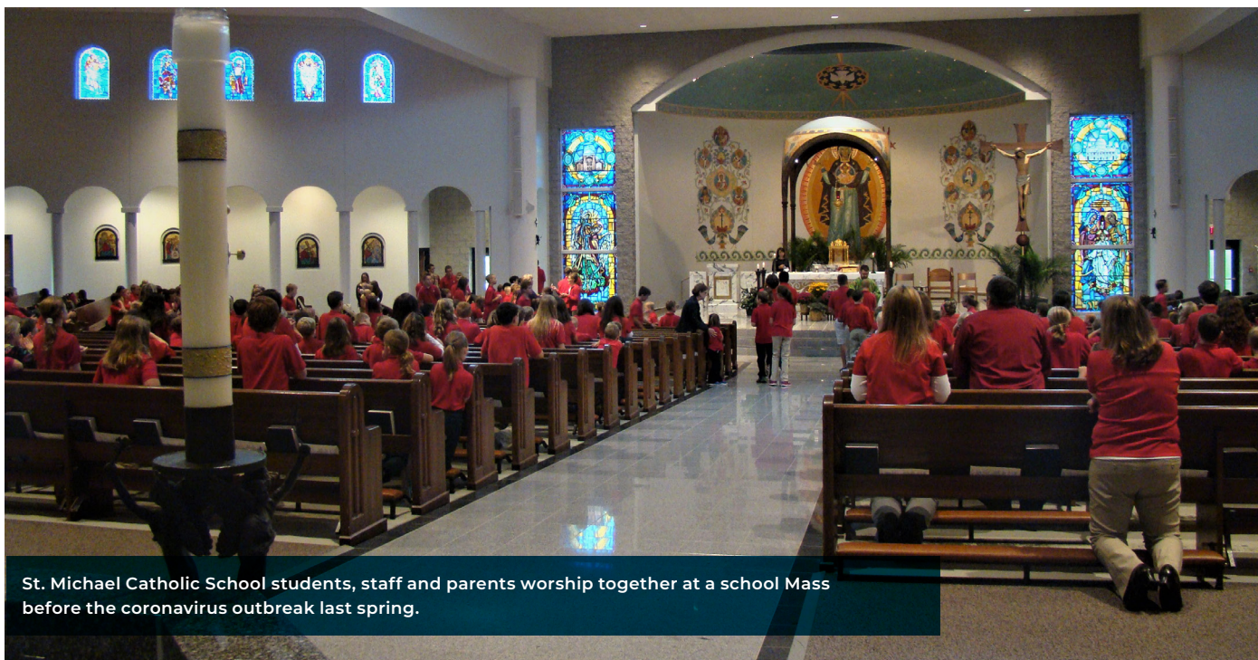
St. Michael Catholic School students, staff and parents worship together at a school Mass before the coronavirus outbreak last spring.