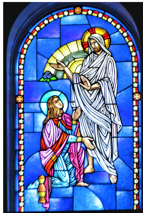
The stained glass windows representing the Glorious Mysteries of the Rosary appear above the entrance to the vesting sacristy at the back of the worship space on the statuary side.

This image of Christ as the gardener not only ties Him to the earth, where he dwelt in bodily form for several weeks and appeared to many eyewitnesses, but it ties directly to this gospel passage, as which Jesus specifically reveals He will ascend to the Father. And while one might question how Mary could mistake this man clothed in white as a gardener, in the traditional sense, a garden is land set aside for a specific purpose; it brings forth life and is often walled off and guarded from whatever would threaten its peace, beauty and purpose. In the beginning, Adam was given responsibility to care for the garden of Eden and look after his bride, but in Genesis 3:6, it is revealed that after Eve speaks with the serpent and eats of the forbidden fruit, "her husband, who was with her," does the same. Adam was present for the temptation of Eve by the serpent, but does not protect her or intercede—and the result is sin and death. By contrast Jesus, the new Adam, is the true gardener, bringing forth life and protecting what is His from every threat, including death itself.