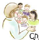
Children's Liturgy of the Word