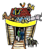
Preschool Sunday School