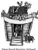
Preschool Sunday School

Preschool Sunday School will be held most Sundays during the 9:00 a.m. Mass, starting February 6. Preschool Sunday School is for children aged 3 by September 1, 2021, four year-olds and five year-olds who are not in Kindergarten. The class will be limited to the first 12 preschool children, no pre-registration required. Children will need to be signed in by a parent at the lower level of the school. Sunday School will be held in the School Cafeteria. We will start taking children at 8:50 AM. Parents must come and pick up their children as soon as Mass is over.