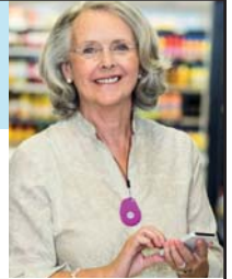
GPS Mobile Above

No Contract • No Fees • Easy Setup • md-medalert.com CALL 800-890-8615