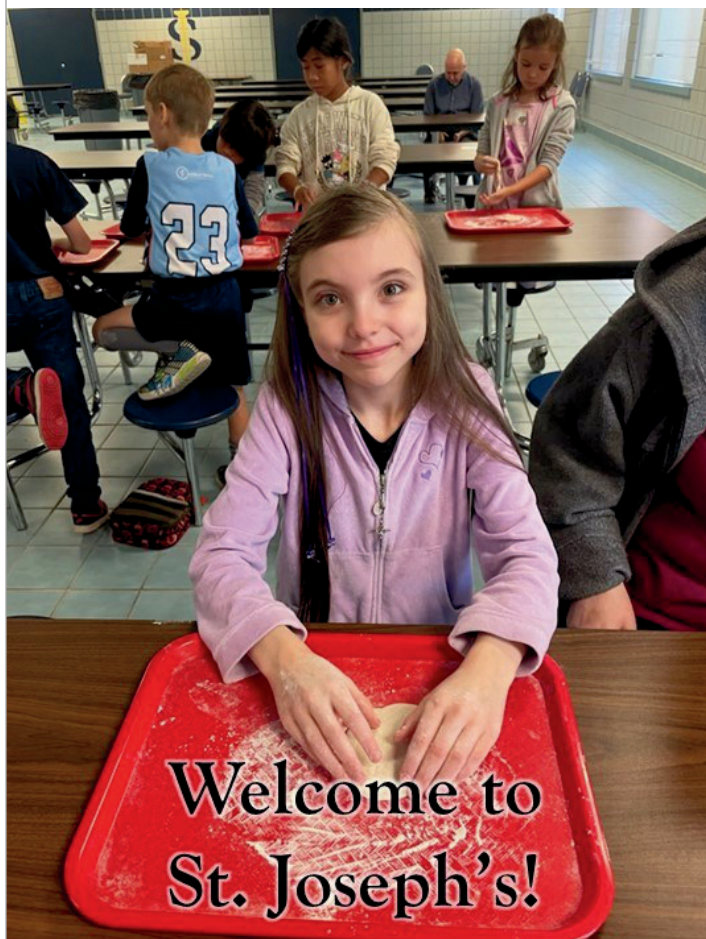
Photo: One of our PREP students makes unleavened bread at her First Holy Communion retreat.

In order to be a sponsor for Baptism or Confirmation, or to have a Baptism at the Parish, you must be a registered parishioner. Please don't hesitate to call if you have any questions, 904-268-5422.