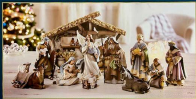
12-PIECE NATIVITY SET

Annual Christmas Open House takes place on Sunday, December 3, after the 8:00 pm, 10:00 pm, and 12:00 noon Masses. Lots of new merchandise! Take home a slice of the "Almost Famous" Gift Shop Rum Cake to enjoy!