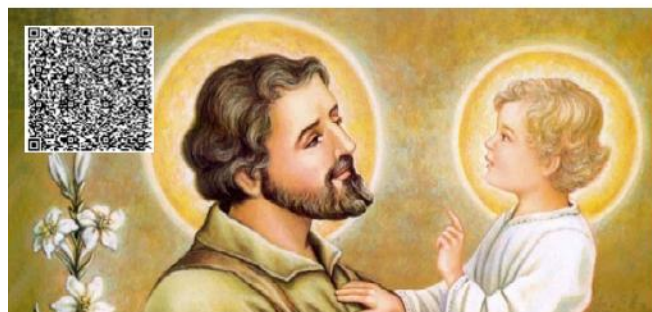
ST. JOSEPH, PILLAR OF FAMILIES, PRAY FOR US.