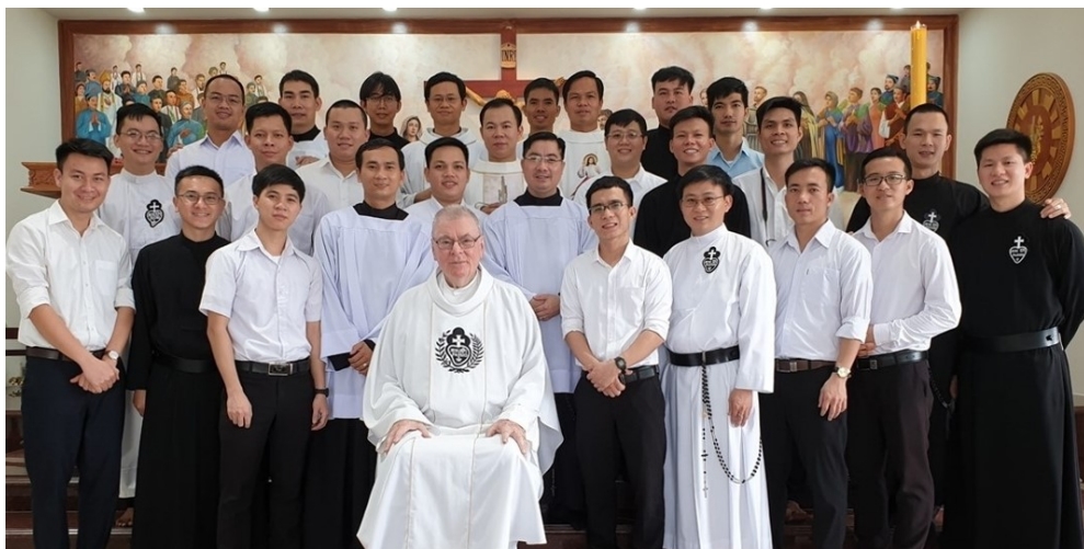
Ready for Mission - and that's me in the middle