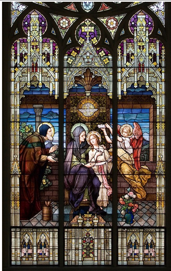
The Feast of Sts. Joachim and Anne the parents of Mary July 26th