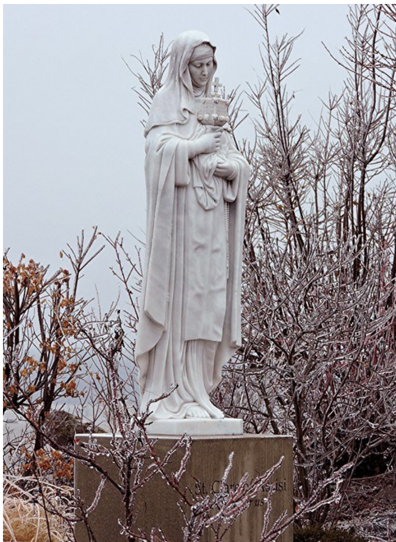
Saint Clare of Assisi, Pray for Us!