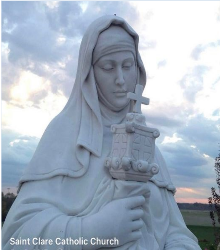
Saint Clare Catholic Church