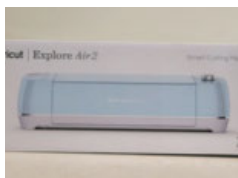
Cricut Explore Air 2 Cutting Machine With $25 gift card to Michael's