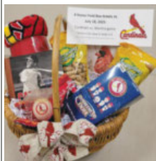
Go Crazy for Cardinals 4 Field box tickets

This replaces our zucchini bread & cookie sales...please be generous!