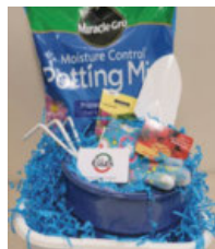
Patio Planter Market Basket & Gia's Gift cards