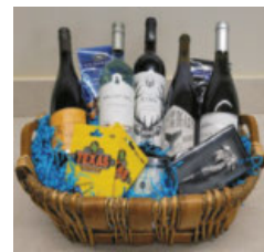
Wine & Steak 5 bottles of wine/ Texas Roadhouse