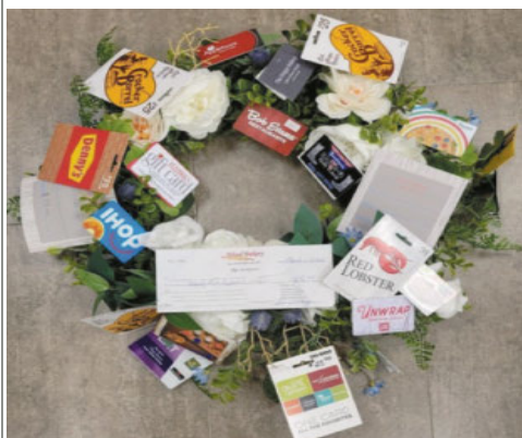
Get Me Out of the Kitchen ($575 in cards) Restaurant Gift Cards on Spring Wreath