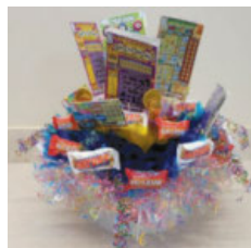
Lottery Tickets/ Candy Bouquet