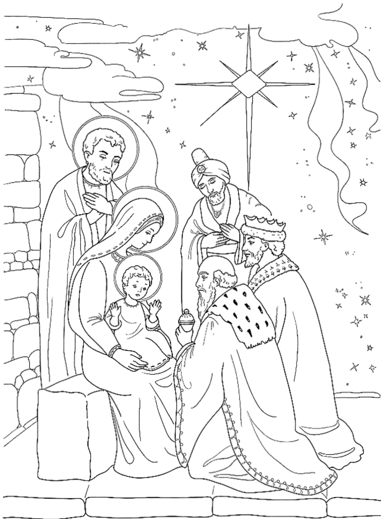
Epiphany of Jesus is when the Three Kings, who were following The Star, arrived in Bethlehem to see Jesus, and give him the gifts of gold, Frankincense, and Myrrh.