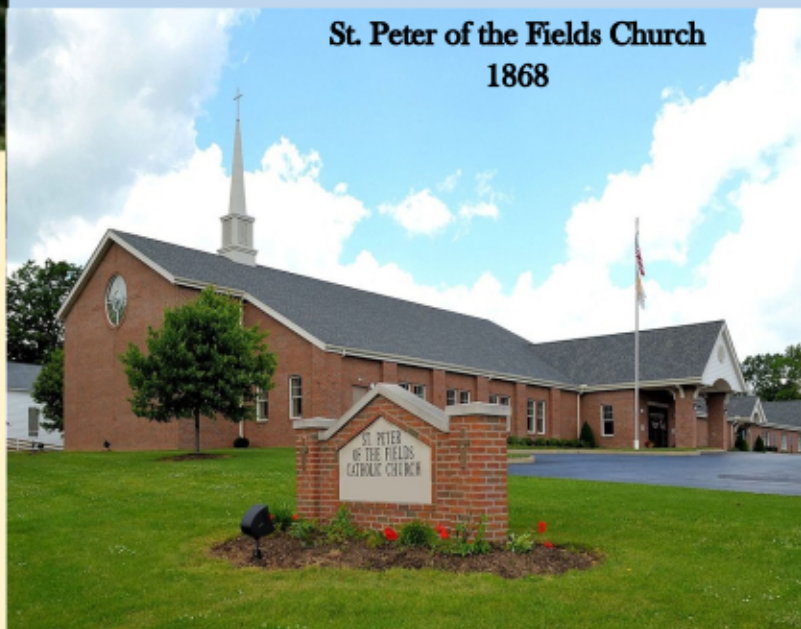
St. Peter of the Fields Church 1868