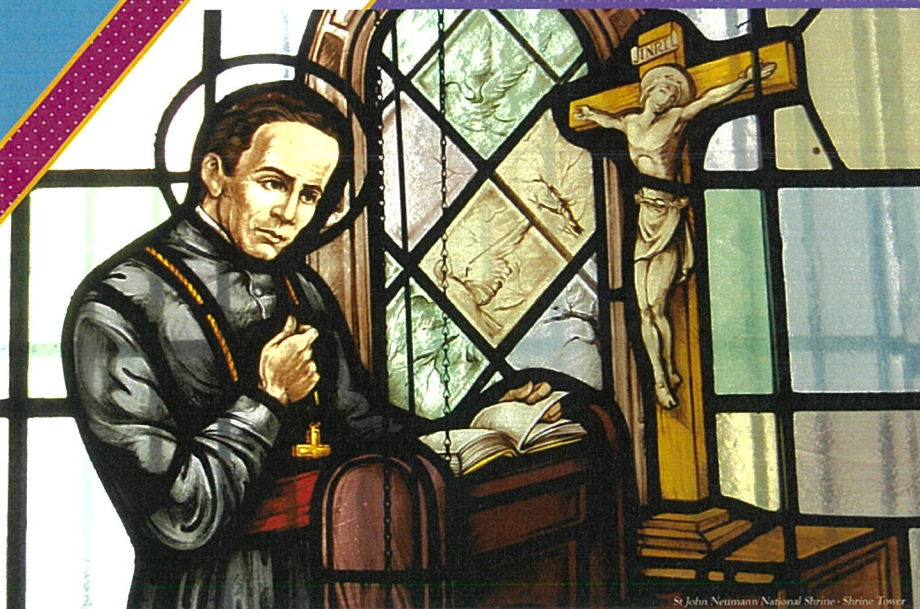
St John Neumann National Shrine - Shrine Tower