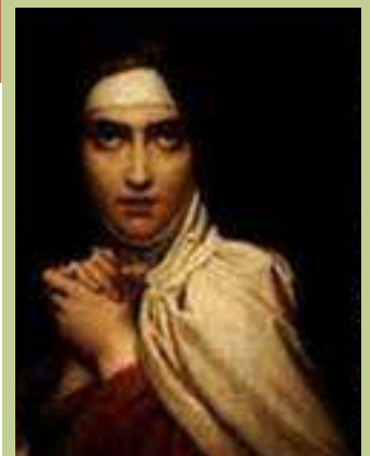
St. Teresa of Jesus (Avila) Feast Day October 15