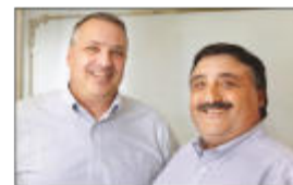
Tony Tirabassi Memorial Counselor

Our monuments and markers are affordable, locally designed and carved using the highest quality granite for 3 generations since 1919.