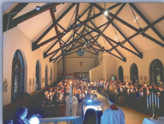
Easter Vigil and overcoming darkness with the Light of Christ