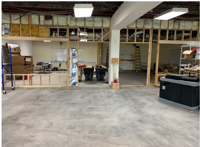
Another side of Higgins Hall (featuring a direct view of several meeting rooms!)