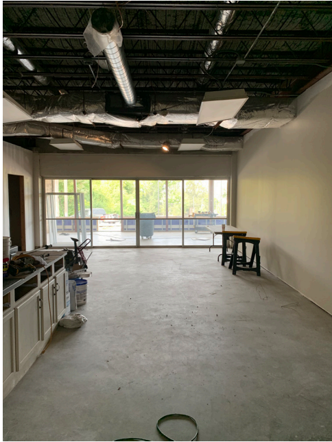
The Newman room

We thank everyone for their inquiries into the progress of our Capitol Campaign. Construction continues at a rapid pace, and we are very excited to see the new spaces developing. Check out the pictures below to see for yourself!