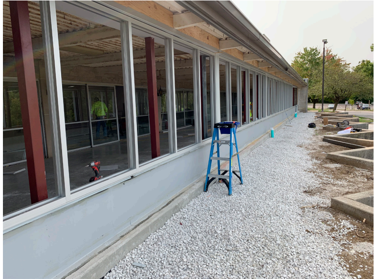
West-facing exterior of St. Paul's