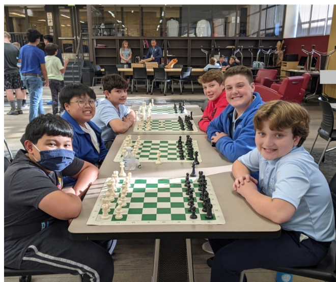
Our students competed in St. Rita's Chess Tournament.