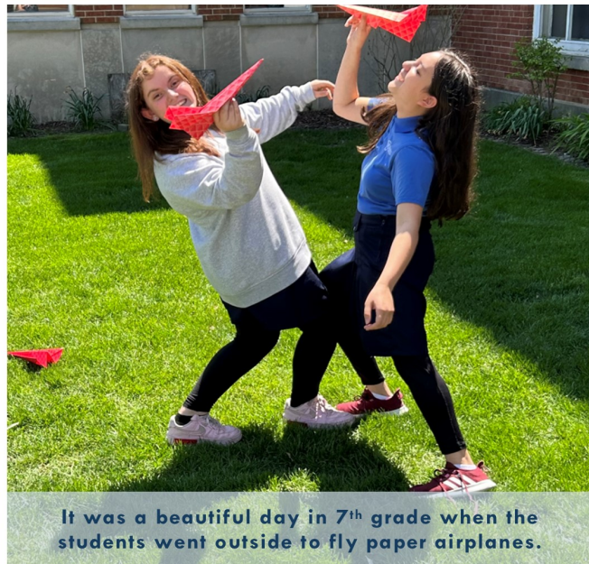
It was a beautiful day in 7 th grade when the students went outside to fly paper airplanes.