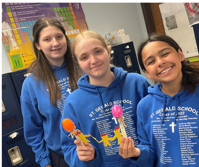
In the STEM Lab, 8 th graders had a Cinco de Mayo challenge and made maracas.

LEARNING · LEADING · SERVING · SUCCEEDING