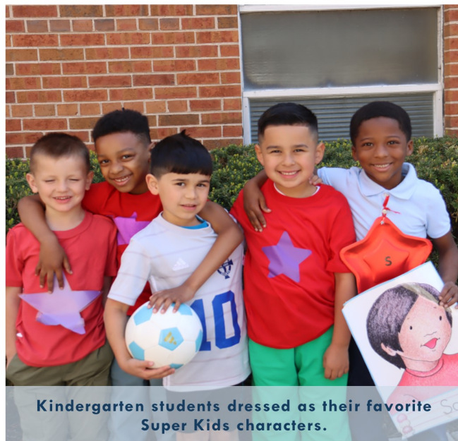
Kindergarten students dressed as their favorite Super Kids characters.