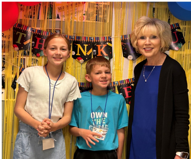
Enjoying their role as Principals for the Day, first order of business was announcing NO homework!

LEARNING · LEADING · SERVING · SUCCEEDING