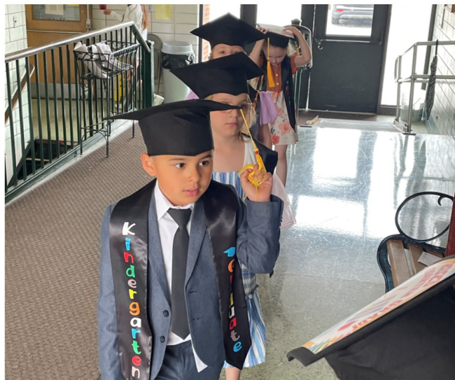
Kindergarten finished the school year with Kindergarten Graduation.