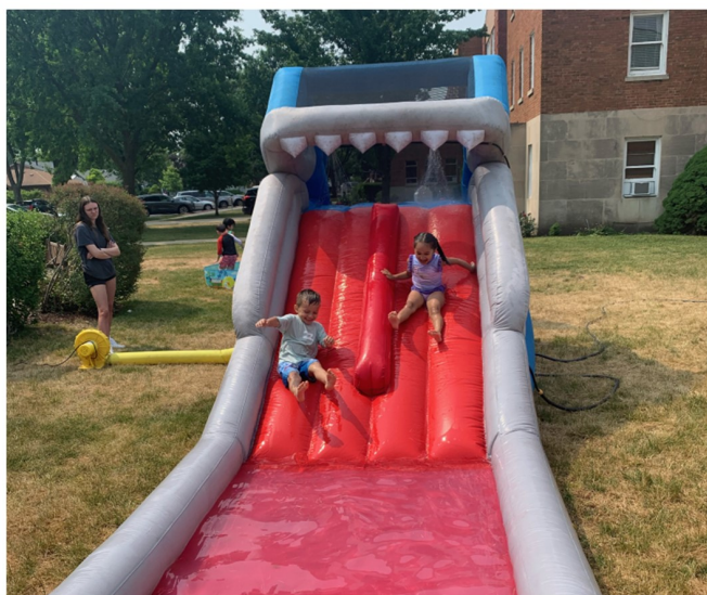
The fun continues at St. Gerald Summer Camp!