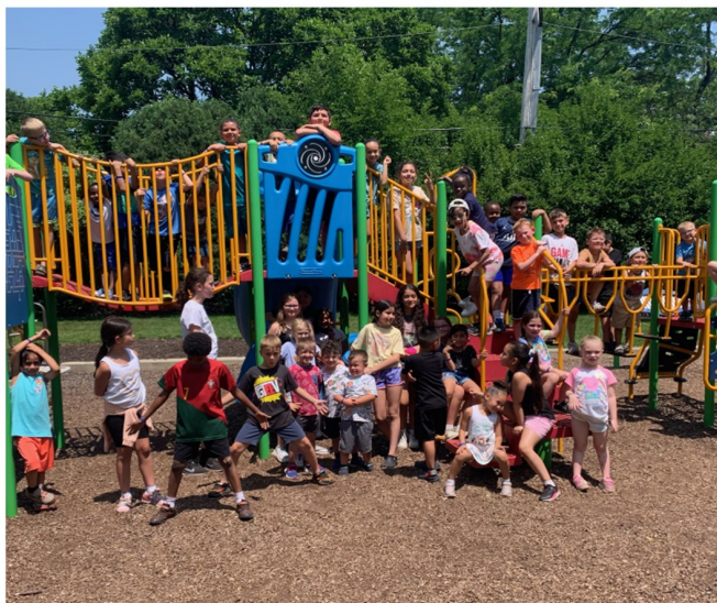
St. Gerald Summer Camp is filled with fun and amazing kids!

LEARNING · LEADING · SERVING · SUCCEEDING