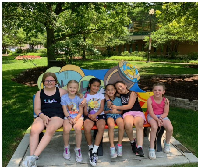
Making memories and new friends at Summer Camp.